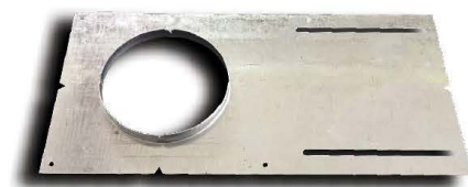
4" & 6" Rough-in plates